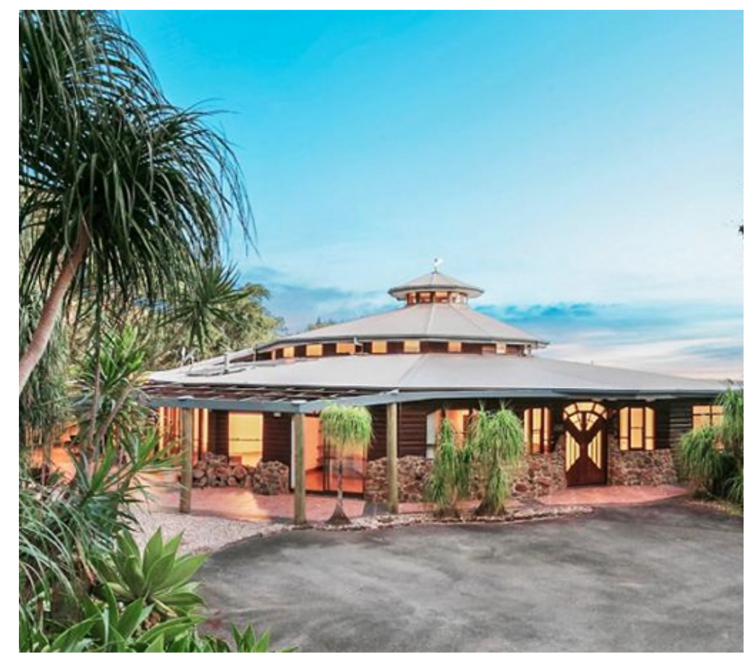
Aquila Retreat Mansion.

outdoor fire bRAN eres also ryoga shqu and helicopter prod/for your un traling en voltage aveller.com/)