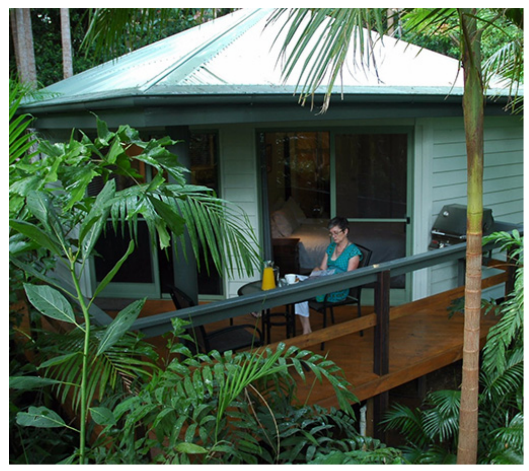
Surrounded by rainforest gardens, Lovestone Cottages offers self-contained cottages.