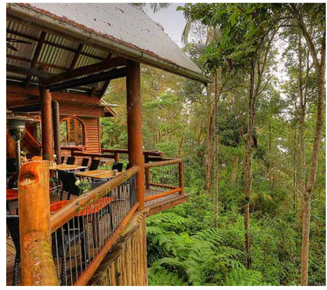
Secrets on The Lake have eleven different luxury cabins.