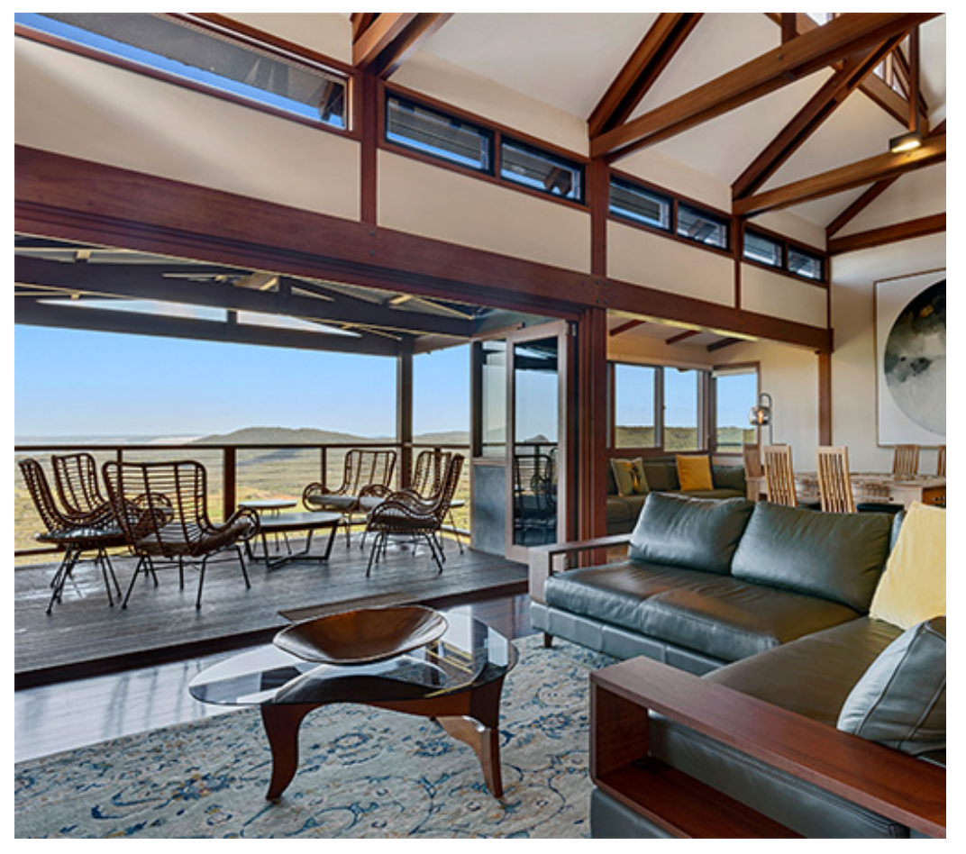
Perch on the ridge overlooking the spectacular Glasshouse Mountains.