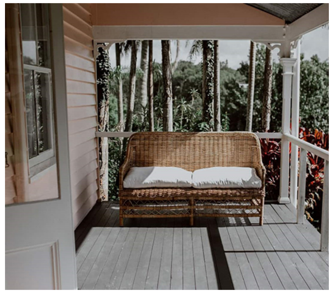
The Postman's Cottage acted as the first Receiving Office for mail from the UK and abroad.

wood-burning stove. The protect has the first work the first way the first way the first way the first way the first way the first way the first way the first way a straight the postal and the postman's Cottage (https://www.airbnb.com.sg/rooms/48401573? adults=1&check_in=2021-11-12&check_out=2021-11-14&translate_ugc=false&federated_search_id=931aeac4-da1e-4ec1-992' ebab4144f42d&source_impression_id=p3_1631687292_EvGcgedUIRa<sup>0</sup> doth doff its hat to that rich history. The amenities – by Mukti Organics – are ace and the fact there is no TV means you can spend your days and nights exploring the shops, restaurants and cafes in Montville.