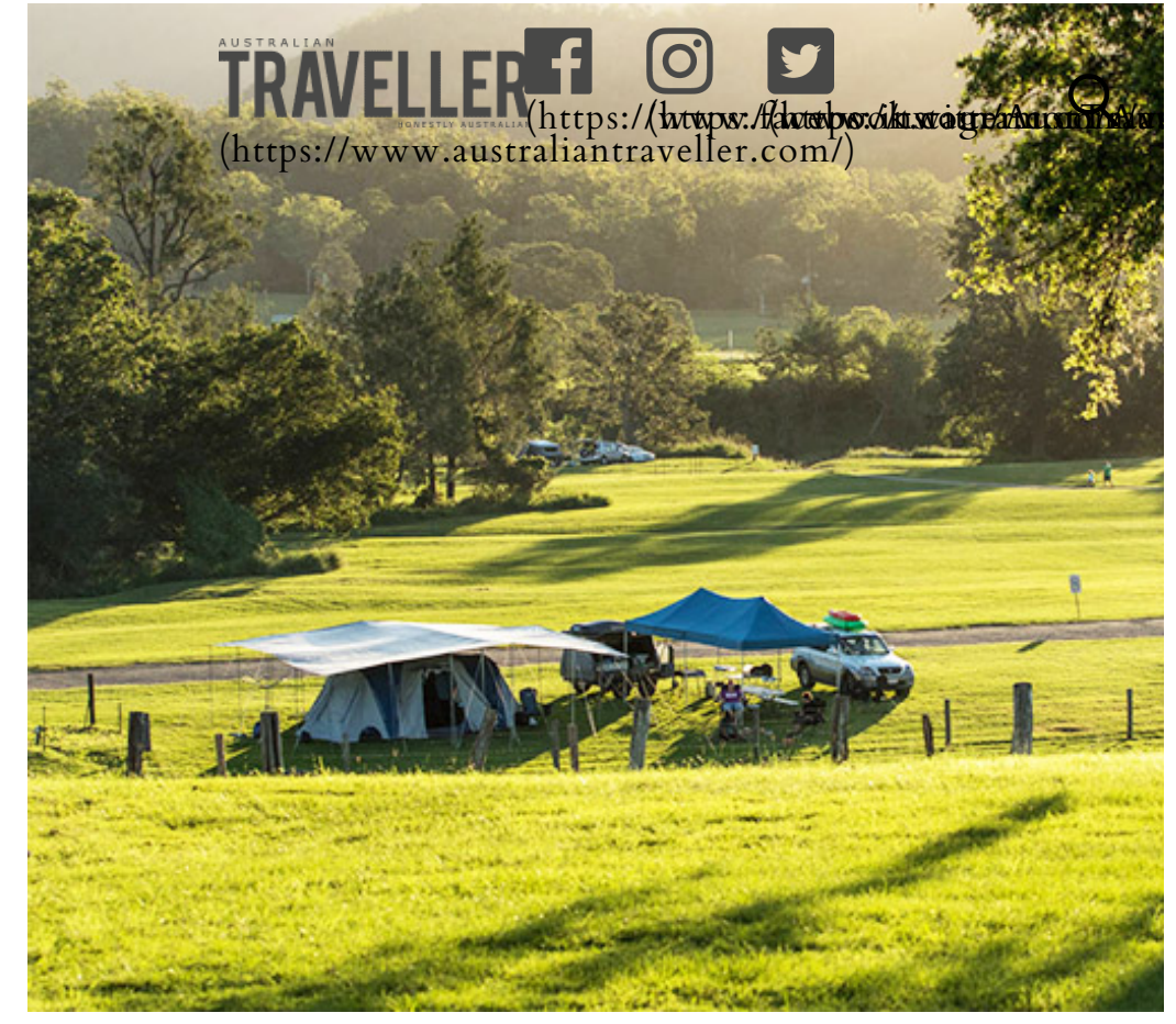
Kenilworth Homestead is still one of South East Queensland's premiere family campsites.

Don't miss: <u>Pet-friendly accommodation on the Sunshine</u> <u>Coast</u> <u>(https://www.australiantraveller.com/qld/sunshinecoast/a-guide-to-pet-friendly-accommodationsunshine-coast/)</u>