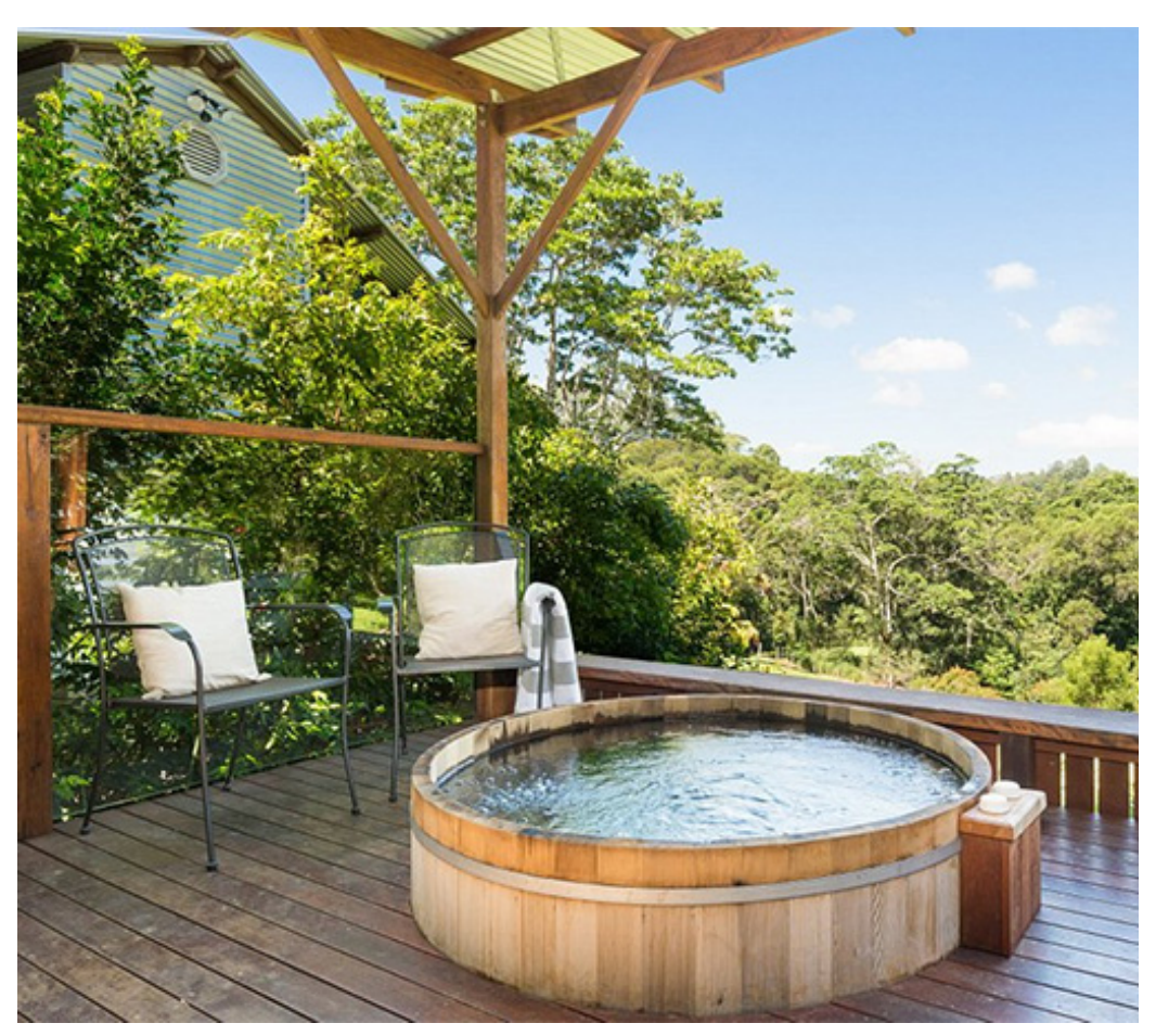
Escape the stresses of everyday life with Spicers Retreats.