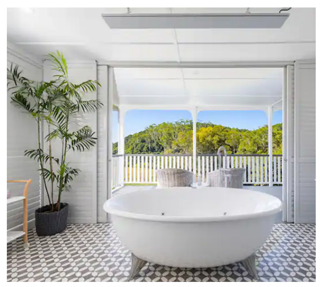
Bath among the gumtrees.

caters to six guests, with three composition of the former of the fruit trees and smash it on your sourdough, spend the day chasing waterfalls (https://www.australiantraveller.com/gld/sunshine-coast/) and then chill around the cosy fireplace.