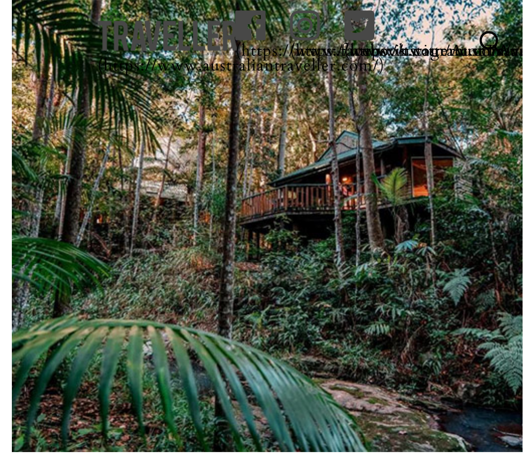
Seclusion is guaranteed at this award winning retreat.

The Best Sunshine Coast Hinterland Accommodation - Australian Traveller